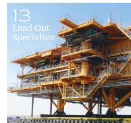
13 Load Out Specialists