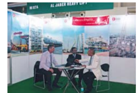
AJHL India was an active presence at Petrotech 2010 with a prominent stall area with significant visitor exposure.