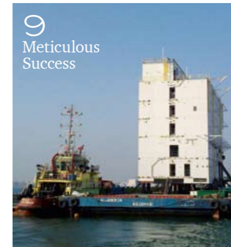
9 Meticulous Success