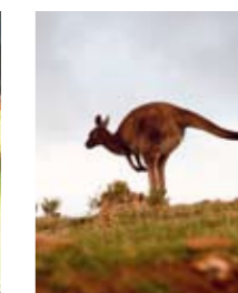
20 Australia Exciting Developments

Global Reach Al Jaber Heavy Lift has world class heavy lift capabilities, an impressive track record and exceptional organisational, engineering and technical facilities.