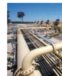
7 Saudi Arabia Building Relationships