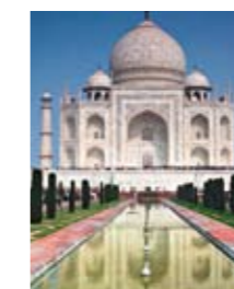
8 India Heavyweight Networking