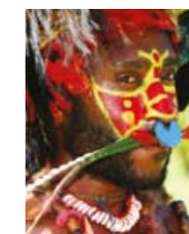
19 Papua New Guinea Exotic Success