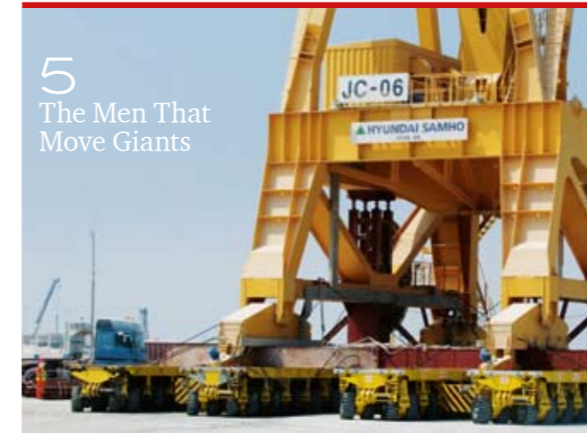
5 The Men That Move Giants