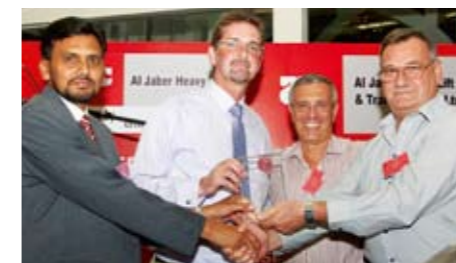
One million man-hours without a single lost time incident, a remarkable achievement.

FROM ITS SINGAPORE HUB Al Jaber Heavy Lift (AJHL) is extending its market presence in Asia and Australasia. The recent Singapore Parallel Train Project has proven to be of groundbreaking significance. AJHL's first project in the region and largest single project undertaken to date, it has proved to be highly successful. The project presented significant challenges, all of which were overcome safely and with some style.