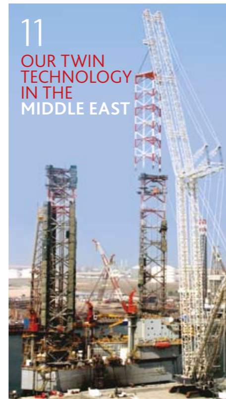
11 OUR TWIN TECHNOLOGY IN THE MIDDLE EAST