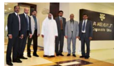
21 AJHL News Safety, People & Equipment