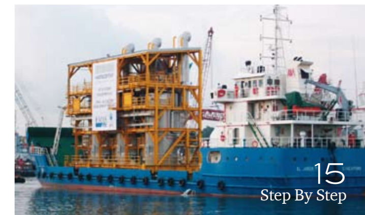
15 Step By Step