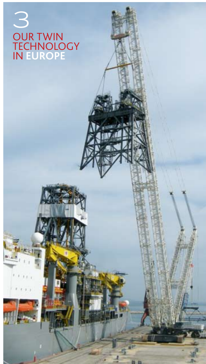
3 OUR TWIN TECHNOLOGY IN EUROPE

We hope that you will find the contents of this magazine interesting and, in the meantime, we would like to thank the Al Jaber family for their support, guidance and vision in the strategic development of AJHL, the Al Jaber Heavy Lift group.”