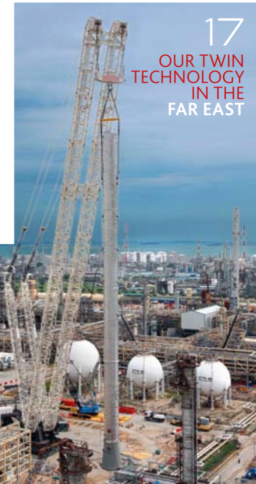
17 OUR TWIN TECHNOLOGY IN THE FAR EAST